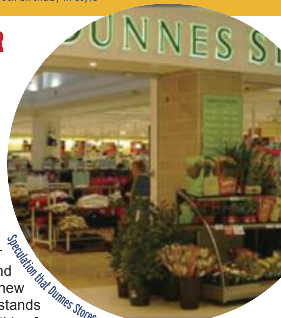
Speculation that Dunnes Stores might open forty new UK stores

Retail Week, the UK retail trade journal, is reporting that Dunnes Stores is planning to double its store number in the United Kingdom's ultra competitive grocery market. According to Retail Week the retailer is mulling over store locations being sold by retailers such as Marks & Spencer and BHS. It is reported that the retailer might open as many as forty new stores to add to the thirty four they currently operate in the UK and Northern Ireland. It is not known if the new stores will include a grocery mix. As it stands Dunnes Stores only retails textiles and clothing from its UK portfolio of stores.