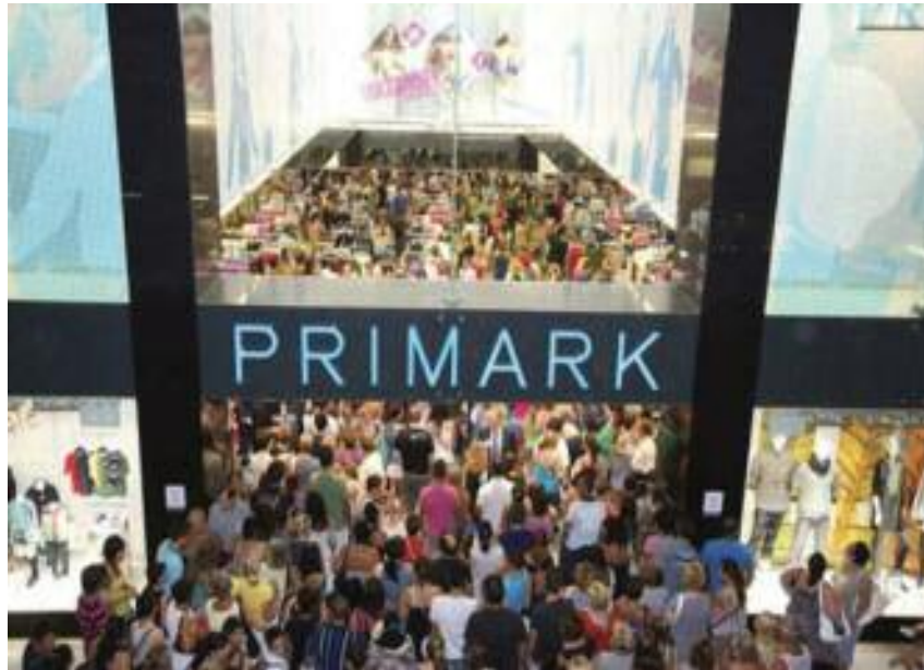
Penneys | Primark opens stateside!

Thursday 10th September 2015 marked the day that Penneys | Primark opened their first store in the United States of America. The store, located in the Downtown Crossing district of Boston, is a huge 77,000 square foot and the opening has caused quite the reaction. The retailer hosted a launch party and,