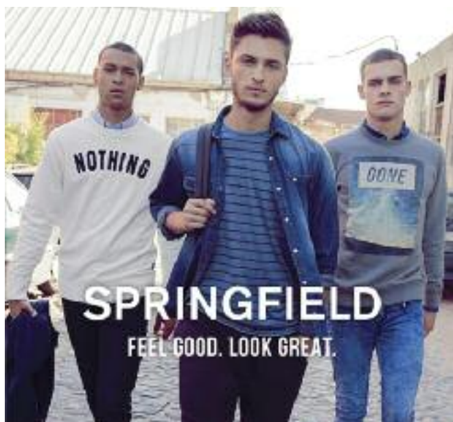
Shaws add to their fashion mix

UK CUSTOMERS HAVE BEEN JUST AS IMPRESSED AS IRISH CUSTOMERS IN THE POWER OF rwr's CLOUD BASED DECISION SUPPORT SOLUTION. AT THIS RATE OF TAKE UP, OUR EXPORT BUSINESS COULD EXCEED OUR HOME MARKET BY THE END OF 2016