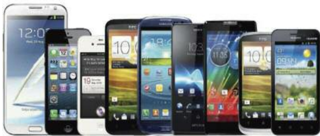
Pointy hits 200

Dublin start-up Pointy has a new service that makes it much easier for retailers to set up and maintain a website. With over 200 stores now using the service, it's proven to be a hit. The Pointy device connects to the barcode scanner and automatically puts scanned items on a website for the store. With consumers increasingly using their smart phones for information before making even smaller purchases, being online is more important than ever. A recent report from Google showed consumer searching for "near me" items have increased a massive 34 times since 2011. Pointy exhibited in the Enterprise Ireland Village at the 2015 REI Retail Retreat last May.