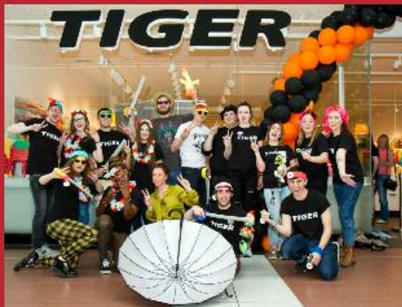
Number seventeen for Tiger Stores