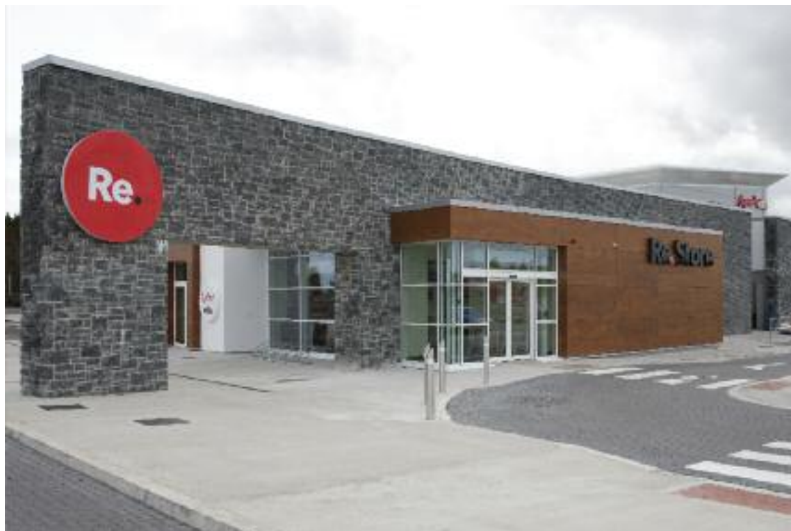
Topaz Ballacolla wins big