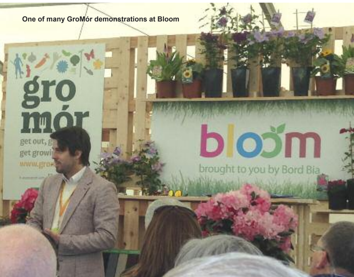
One of many GroMór demonstrations at Bloom

Much was achieved during the inaugural year for GroMór. The garden centre industry was brought together to include independents, multiples, co-ops, nurseries and suppliers and the concept that was initiated this time last year, was brought to life in the spring with the aim of getting the country growing. GroMór has 65 garden centre and 20 nursery members in 23 counties, so a GroMór centre with experts on hand to offer advice, is never too far away. There has been huge support for GroMór in year one and with a membership waiting list for next year, the