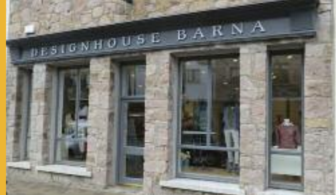
Celebrating 10th birthday in style